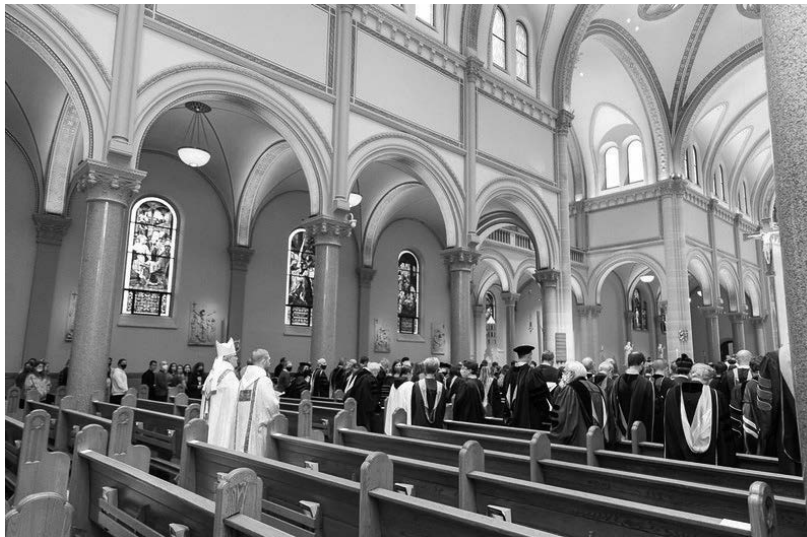
The Thomistic Institute prides itself on facilitating Catholic questions and ideologies among both Catholic and secular colleges.