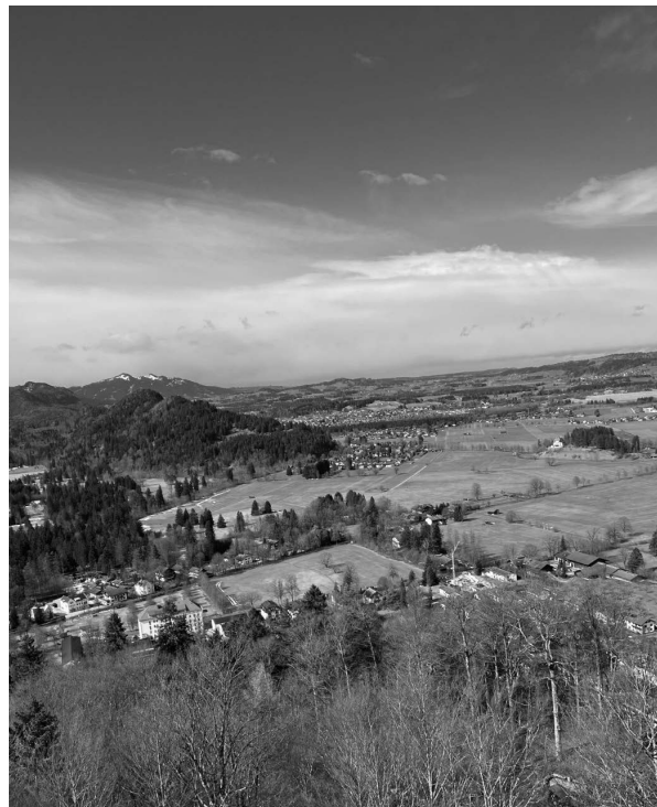
Villages, farmland, roads, and the Alps are just some of the things that can be seen from the balcony at the top of Neuschwanstein Castle.

I hope anyone reading this who has not gone on an international trip strongly considers it. Look into abroad opportunities every semester, even if you think you have no interest or ability. You will be surprised by what your conscience tells you. You will be surprised what few excuses you actually have. Take it from me: let yourself be impulsive.