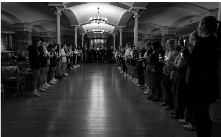
The crypt is alight with the spirit of SVC women.