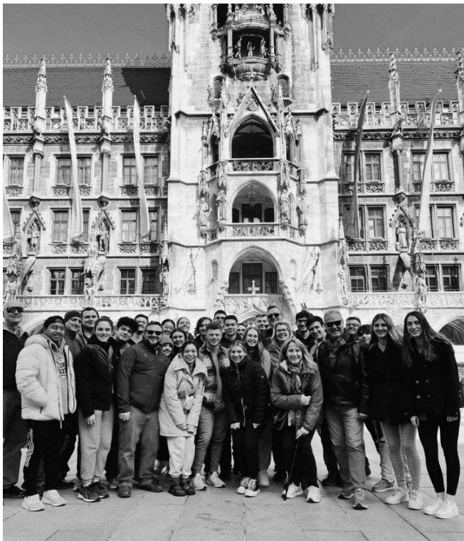
The SVC group poses for a photo during the first day of the spring break trip in Munich, Germany.

Germany has made me reflect on myself, on the professors and other students who accompanied me on the trip, and on America itself. We are used to living such a fast-paced life, minute to minute and hour to hour. We get lost in midterms, jobs, friend drama, sports, and American news and politics every day. We are not used to having a week to truly have new experiences. Most of us are not used to waking up every day for a week and realizing that we are on a different continent, in a foreign country. We are not used to having so much time to take in so many new things.