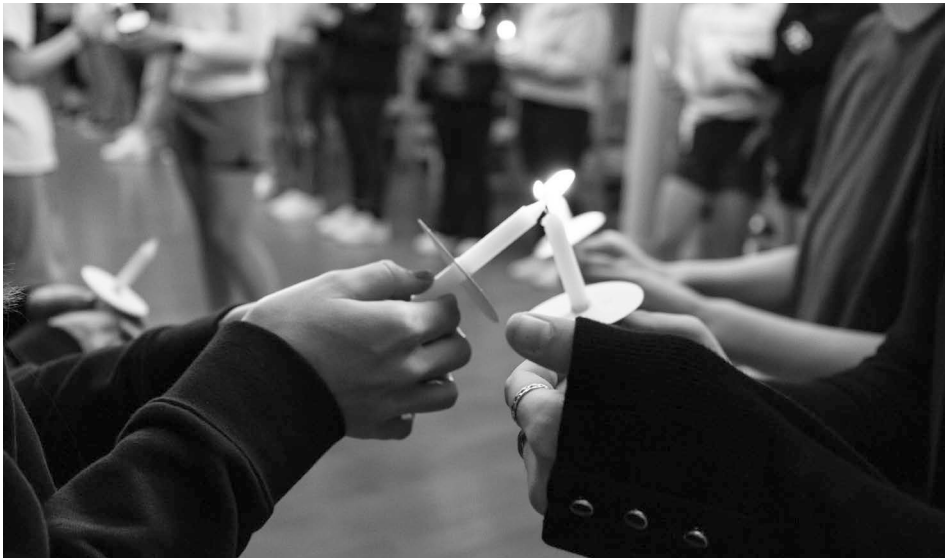
The seniors and freshmen unite to light their candles.

At Saint Vincent College, International Women's Week was celebrated last week from March 13-17. With multiple events designed to empower and celebrate the women in the SVC community, the second annual Lighting Our Way Forward event was the most heartwarming.