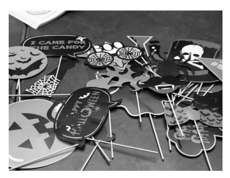
Spooky photo booth items from the Citrone Family Commuter Center's 2019 Halloween party.

Personal verybody loves to celebrate Halloween one way or another, and Saint Vincent's clubs offer plenty of ways to get into the spirit! From volunteer work to dance parties, you're sure to have the fright of your life this year!