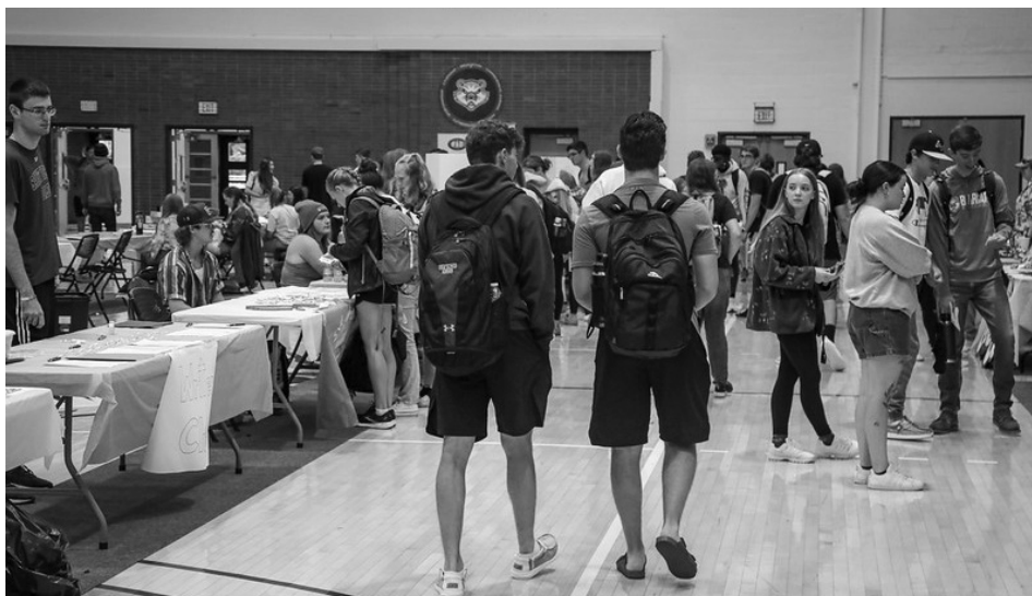
Students walking around at the Fall 2022 club fair.