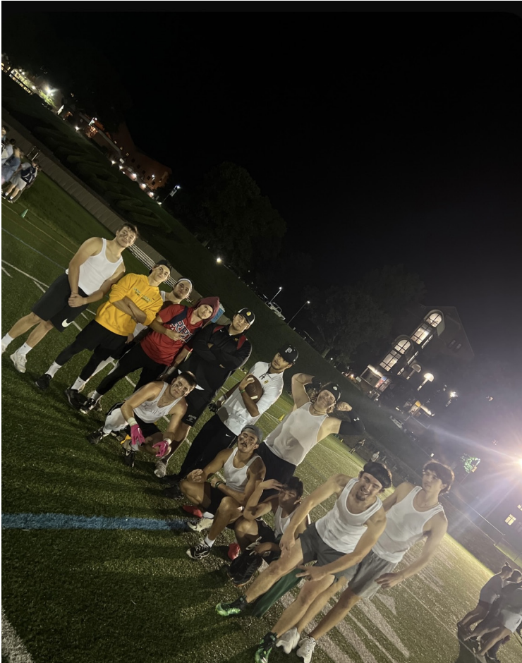
Team Bomb Squad poses for a pic after a hard-fought victory in overtime during flag football.