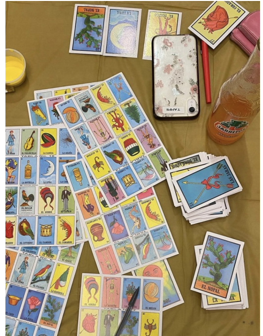
Students learned how to play the popular Mexican game lotería, which are the cards and board shown in this picture.