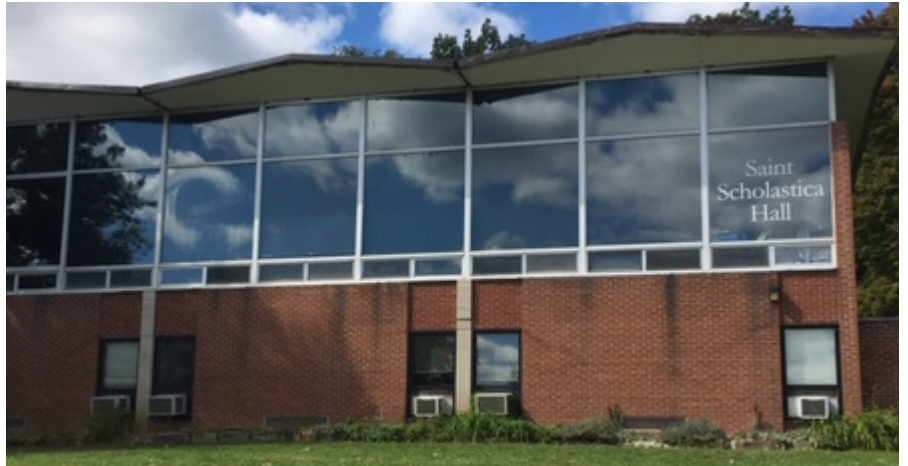
One element of SVC’s Master Plan is the potential demolition of certain older buildings, including Saint Scholastica Hall.