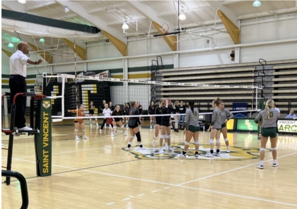
Lady Bearcats prepare for a serve during a 3-0 victory over Waynesburg.

ent athletes being recognized for outstanding play, the Lady Bearcats have a very tough and competitive squad.