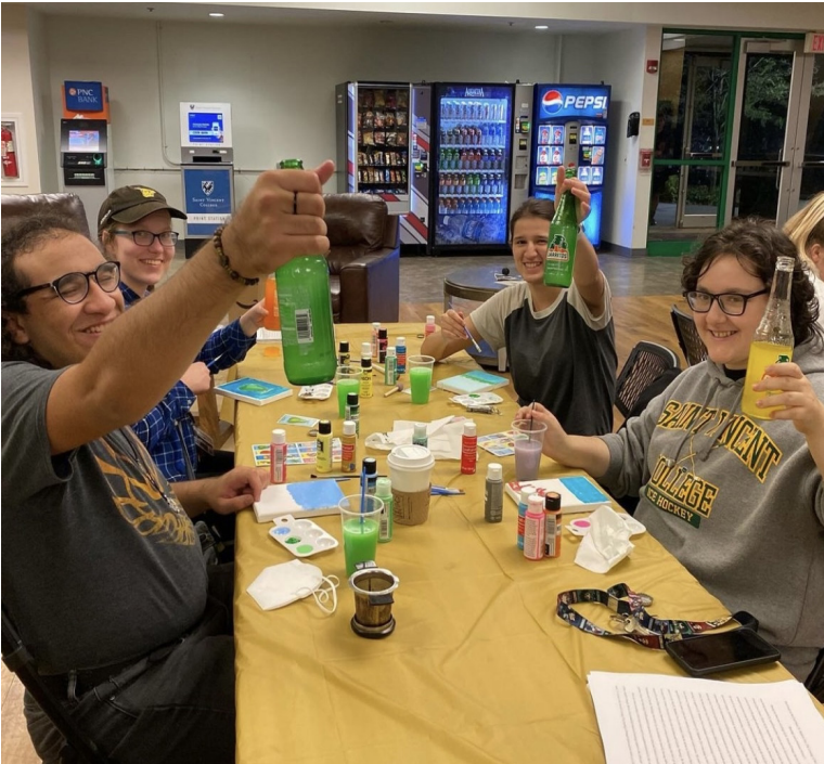
Students giving toast with the popular Mexican drink Jarritos at Painting with Heritage night. (SOURCE: stepintosvc (Instagram)).