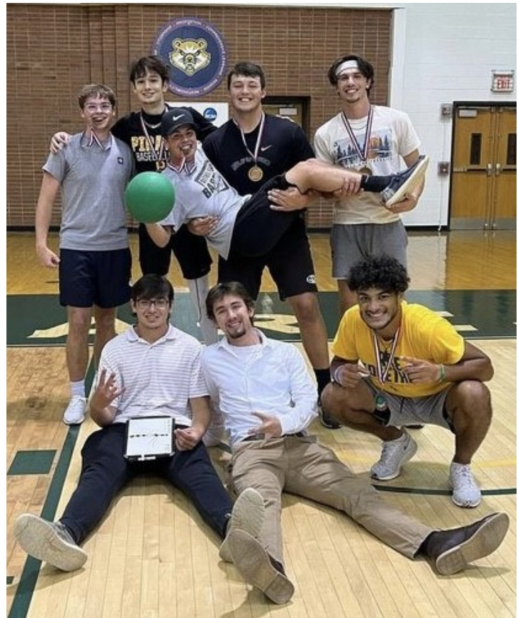
Winning dodgeball team "God's Squad" poses for a picture after several close rounds.

Students across Saint Vincent College are having a blast with the Activities Programming Board (APB) events happening across campus. On September 23, APB hosted a dodgeball tournament in which students gathered in groups of five to seven to play dodgeball.