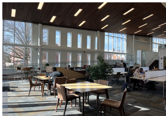
Students congregating in the Latimer Library where the International Coffee Hour was held.