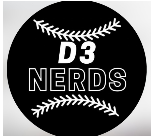
D3 Nerds Podcast Logo.